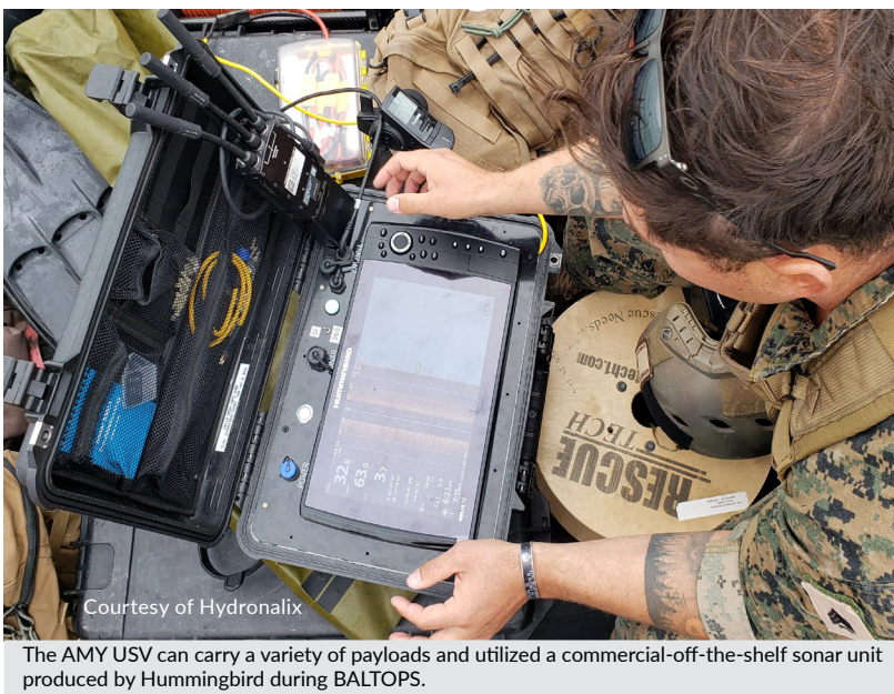
The AMY USV can carry a variety of payloads and utilized a commercial-off-the-shelf sonar unit produced by Hummingbird during BALTOPS.

"Once we get satellite communication we believe that we demonstrated that we can get a UUV to transmit sonar images from underwater to a gateway buoy out through a radio and then to IS2 to ops and then federated to everybody. The AMY boat could essentially become a mobile gateway buoy and be able to loiter in an area with underwater sensors and pass that information up and out without a man being there," Jackson explained.